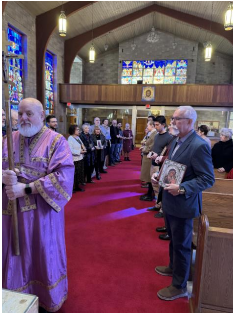
Icon Procession – Sunday of Orthodoxy!